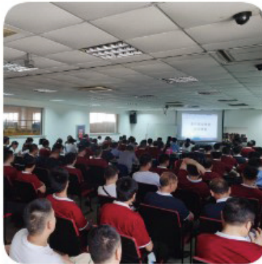
▶ Training activities