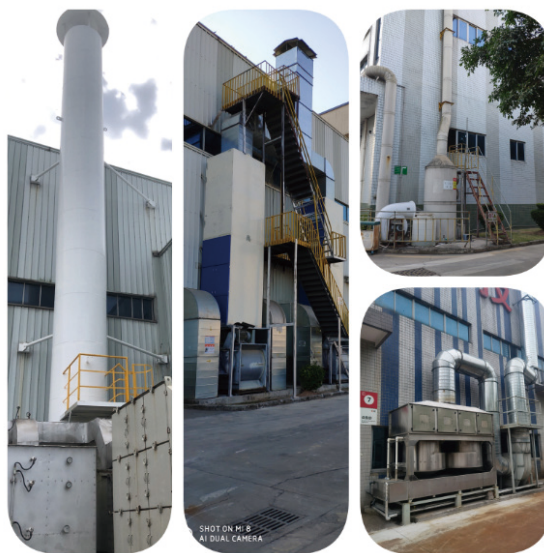
➤ Exhaust air treatment equipment

smoke collector and dust remover to cool down and purify the hot smoke in the casting production process. These waste gases are discharged at or above the national and local government regulated discharge height after being treated by the environmental protection facilities. The Fuxin plant has followed the requirement of the government to use biomass pellet fuel to substitute coal as the fuel of boilers. The biomass pellet fuel mainly composed of environmental-friendly materials such as straw, rice husk, peanut husk, corn cob, camellia husk, cottonseed husk, etc.; and it generates less greenhouse gases when compared to coal. Ningbo plant implemented emission reduction measures in accordance with the provisions of the local Bureau of Ecology and Environment, such as using water-based paint instead of oily paint in the painting process; re-transforming the spray room to improve the exhaust air collection rate up to 90%.