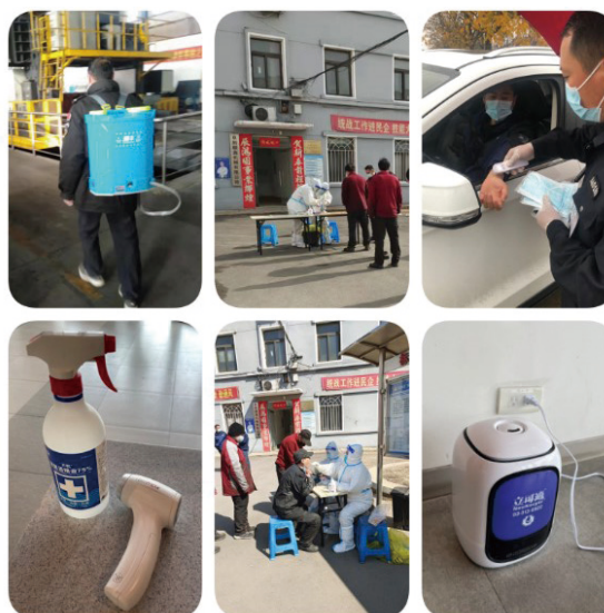
➤ Anti-epidemic measures and supplies

Implements special work arrangement by allowing staff to take terms to work from home for certain offices.