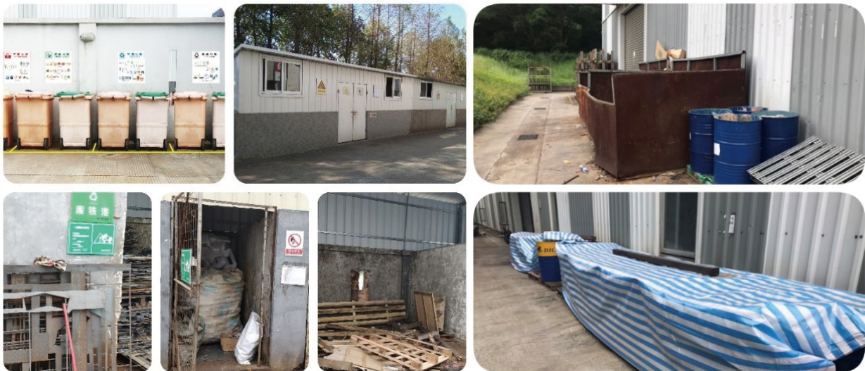
▶ The plants provide storage places and warehouses for different types of waste to prevent recyclable waste from being mistaken for non-recyclable waste disposal

The Group sets targets at the beginning of the Reporting Period in keeping the production intensity of hazardous wastewater constant as last year; and such targets have been achieved. Please refer to the below table and the section headed "Summary of Environmental Data and Performance" for the relevant data.