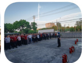
➤ Fire drill