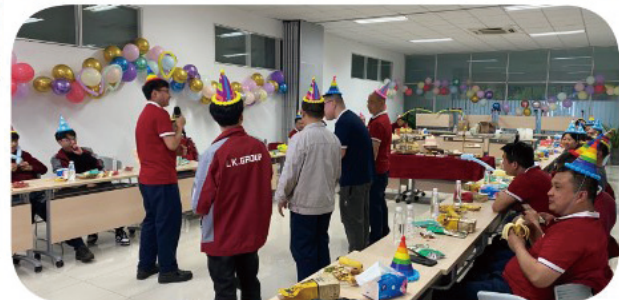
▶ Recreation room and leisure activities